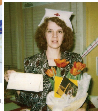
Used with permission.

team and refused to treat her like a statistic. My sister and I moved home full-time so my mom wouldn't be alone, and, to this day, we have no regrets. The three of us approached my mom's treatment as individualized care. We didn't want an exorbitant amount of information from the Internet; it was confusing and the information that was available applied to the general population—we wanted to think outside the box. From day one, her body's reaction to the nine-hour surgery and subsequent chemotherapy was a rollercoaster ride. But there was a pattern to many of the symptoms she presented